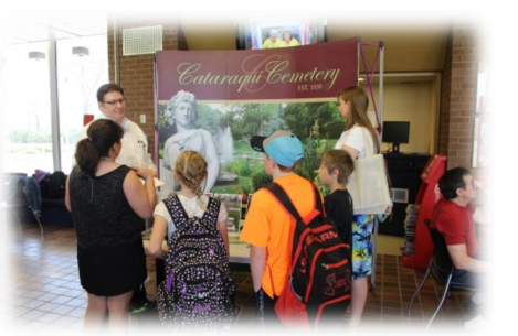
Cataraqui Cemetery Group