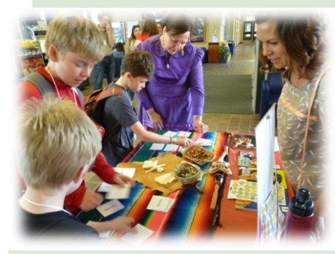
Four Directions Aboriginal Learning Circle