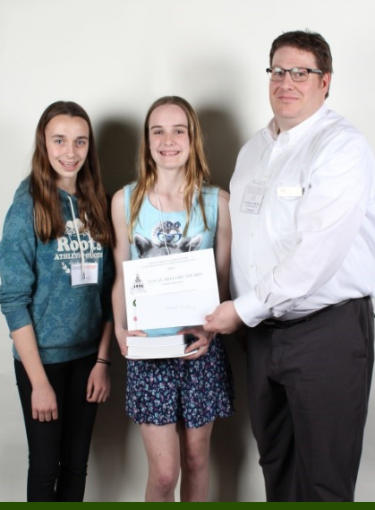
Cataraqui Cemetery Group sponsored the best local history award .