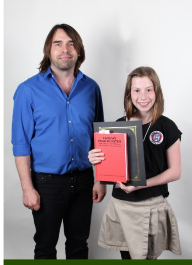
CBD sponsored the prize for best Bilography research