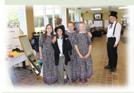
Historical Costume Club