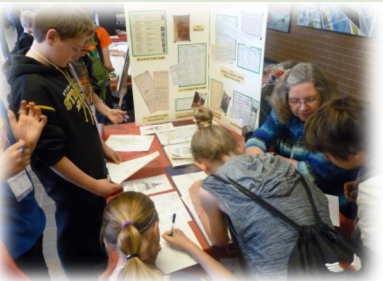
OGS Kingston Branch