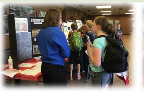
Dictionary of Canadian Biography