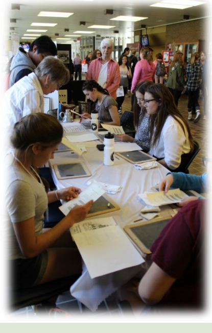
Frontenac School Museum