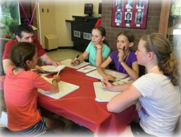
OHFA Trivia Challenge