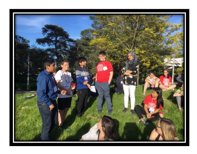
During orientation activities in the evening we met and shared ideas with other students from all over Ontario.