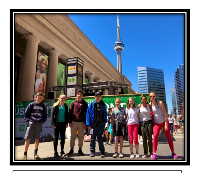
Off the train! What a great location to wait for our shuttle bus!