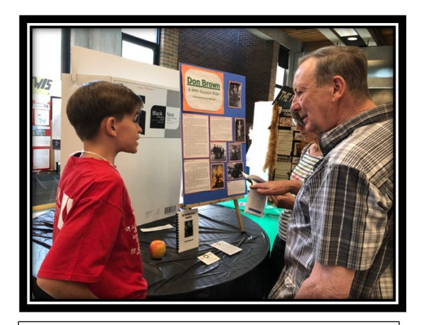
Sharing our projects with the public is a big part of the Showcase.