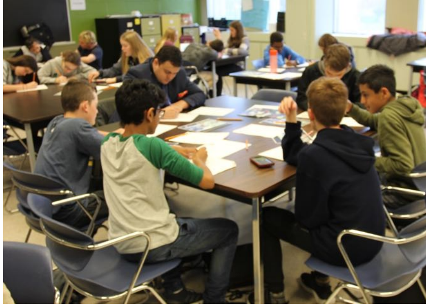
Students learned to draw comic strips.